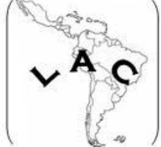
LATIN AMERICA CHAPTER INTERNATIONAL FEDERATION FOR THE SURGERY OF OBESITY AND METABOLIC DISORDERS