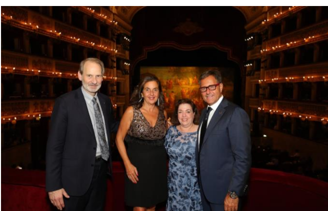
San Carlo Opera House, Presidential Dinner, August 31