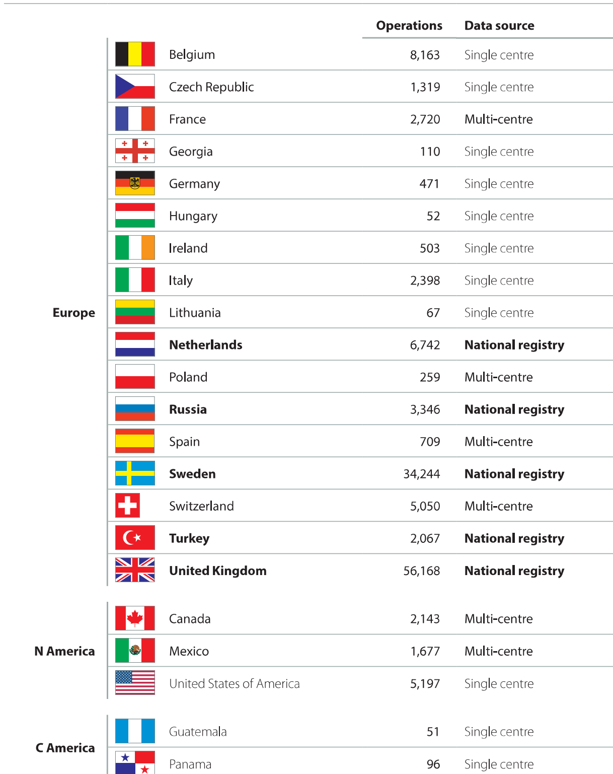
Contributors to the IFSO Global Registry