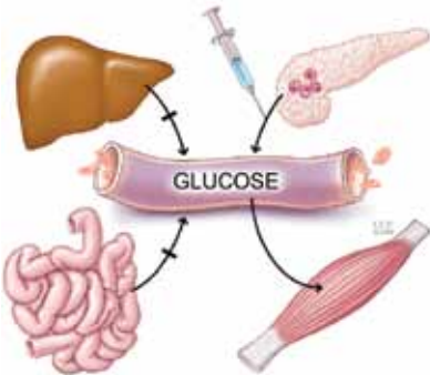
Pathophysiology of Type II Diabetes Mellitus