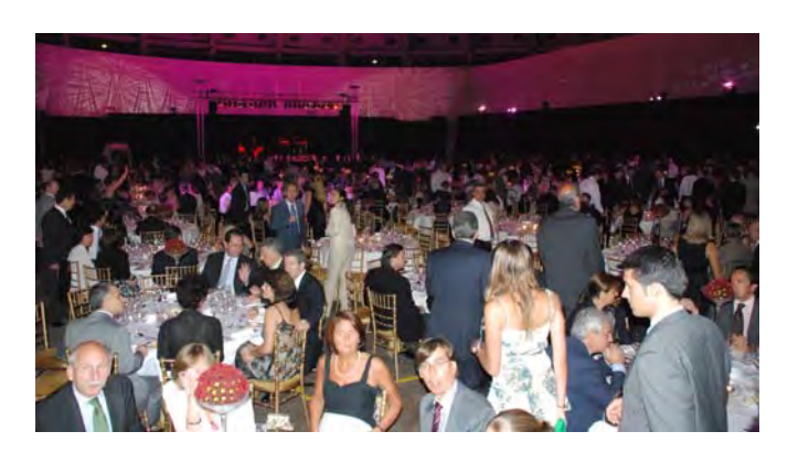
The gala diner in the Crystal Palace