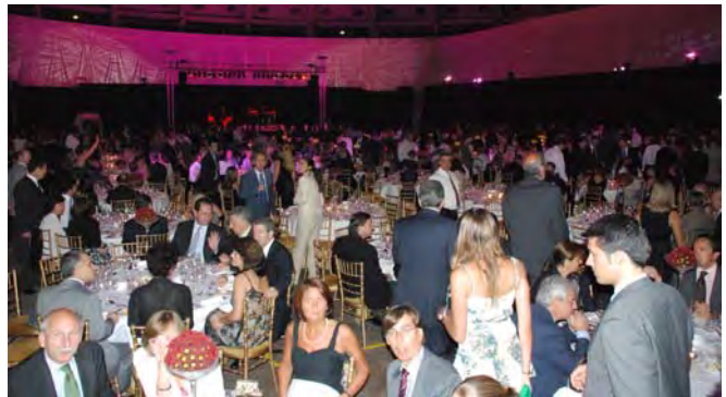
The gala dinner in the Crystal Palace